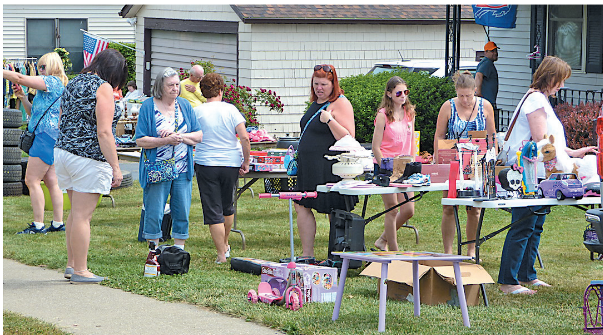
Photos from 10 Mile Garage Sale throughout the previous years

The event is presented by Niagara Frontier Publications, publisher of the Niagara County Tribune-Sentinel, Island Dispatch and Grand Island PennySaver. Visit www.wnypapers.com .